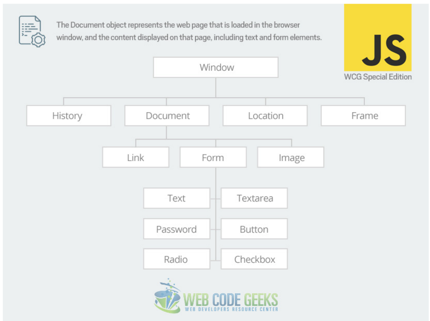
Figure 1.2: The Javascript Object Hierarchy

Properties define the characteristics of an object. Examples: color, length, name, height, width Methods are the actions that the object can perform or that can be performed on the object. Examples: alert, confirm, write, open, close .