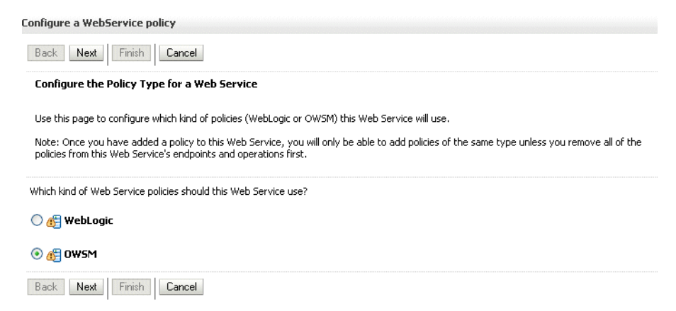
Figure A-2 Selecting the Oracle WSM WS-Security Policy Type

8. If you had instead mistakenly selected a particular Web service operation, note that you are not presented with the policy choice screen, as shown in Figure A–3. Click Cancel to start over.