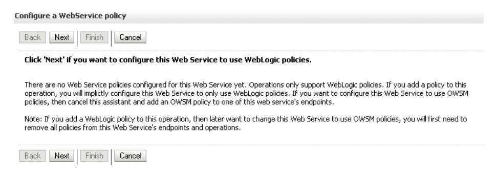
Figure A-3 WebLogic Server Policy Page

9. Select the Oracle WSM WS-Security policies that you want to attach to this Web service, and use the control to move them into the Chosen Endpoint Policies box, as shown in Figure A–4. Click Finish when done.