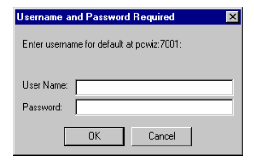
Figure 3-2 Authentication Login Screen

Note: See Section 3.3.2, "Understanding BASIC Authentication with Unsecured Resources" for important information about how unsecured resources are handled.