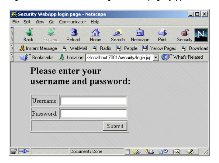
Figure 3–4 Form-Based Login Screen (login.jsp)

The login screen prompts the user for a user name and password. Figure 3–4 shows a typical login screen generated using a JSP and Example 3–6 shows the source code.