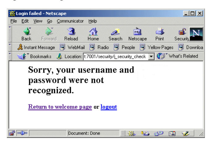
Example 3-7 Login Error Screen Source Code