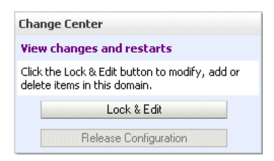
Figure 1 Change Center

This is the starting point for using the Administration Console to make changes in WebLogic Server. See Section 3.4, "Using the Change Center."