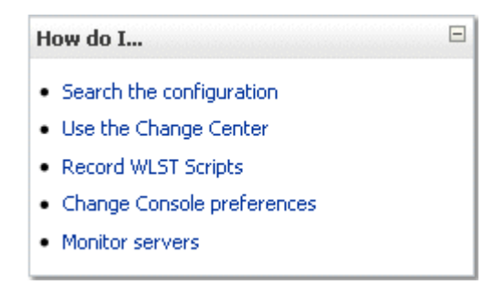
Figure 3 How do I...

This panel includes links to online help tasks that are relevant to the current Console page.