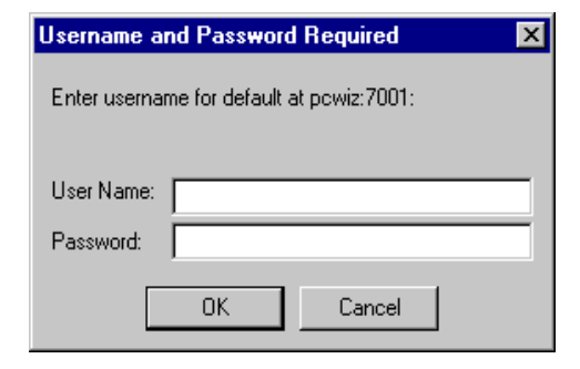
Figure 3-2 Authentication Login Screen

With basic authentication, the Web browser pops up a login screen in response to a WebLogic resource request. The login screen prompts the user for a user name and password. Figure 3–2 shows a typical login screen.