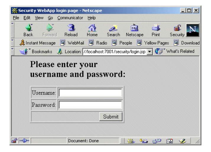
Figure 3-4 Form-Based Login Screen (login.jsp)

The login screen prompts the user for a user name and password. Figure 3–4 shows a typical login screen generated using a JSP and Example 3–6 shows the source code.