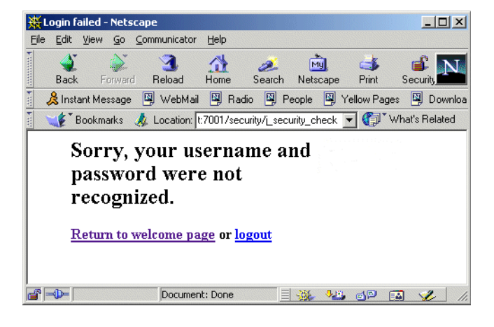
Example 3-7 Login Error Screen Source Code