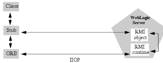
Figure 7–1 RMI Object Relationships