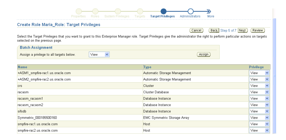
Figure 2 Assigning View Privileges

8. In the Create Role Administrator page (Figure 3) she grants Maria the role.