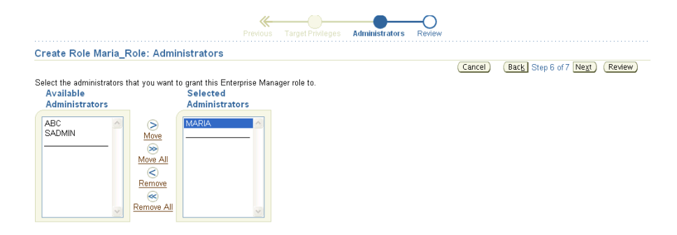
Figure 3 Granting Role

8. In the Create Role Administrator page (Figure 3) she grants Maria the role.