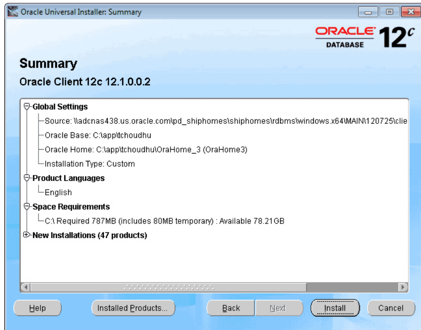
Figure 1-5 Oracle Universal Installer Summary Screen