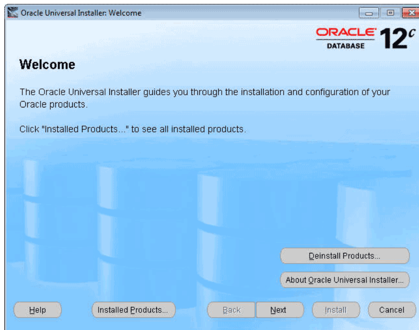
Figure 1-1 Oracle Universal Installer Welcome Screen

The Welcome window appears as shown in Figure 1-1 .