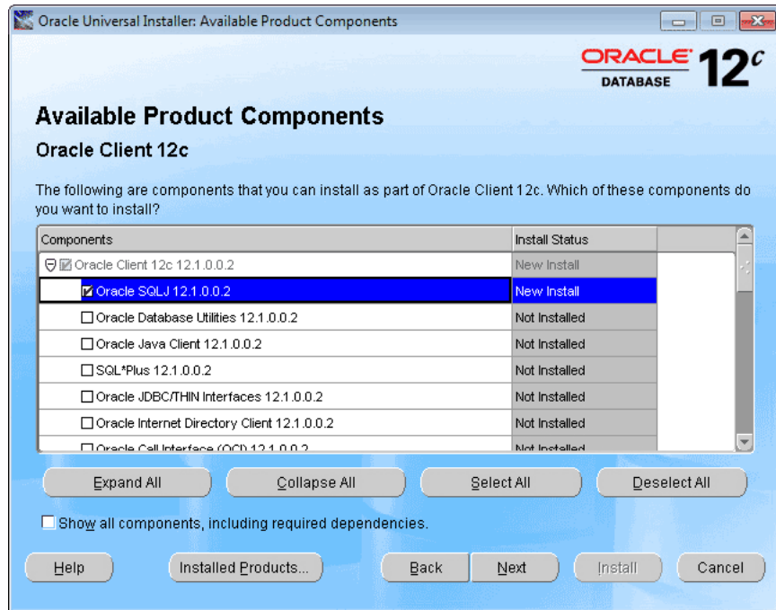
Figure 1-4 Oracle Universal Installer Available Product Components Screen