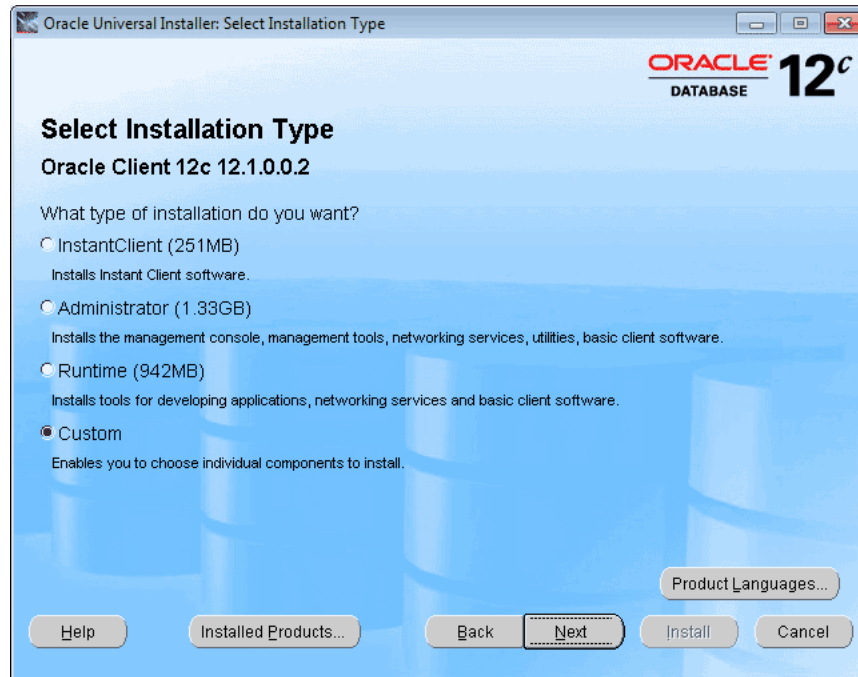
Figure 1–2 Oracle Universal Installer Select Installation Type Screen

The Select Installation Type window appears as shown in Figure 1–2 .