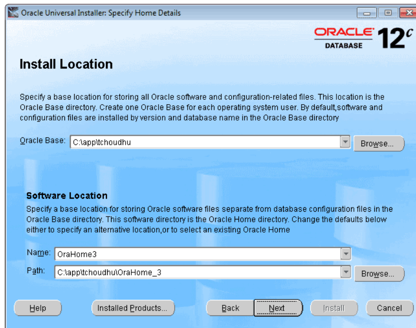
Figure 1–3 Oracle Universal Installer Install Location Screen

The Install Location window appears as shown in Figure 1–3 .