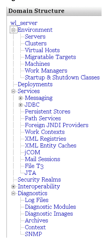
Figure 3-2 Domain Structure