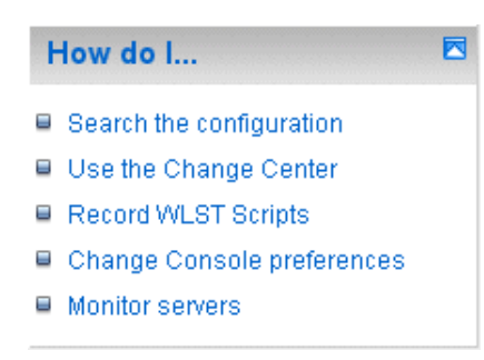
Figure 3-3 How do I...

This panel includes links to online help tasks that are relevant to the current Console page.