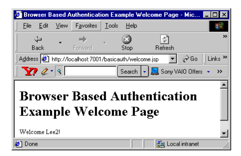
Figure 3-3 Welcome Screen