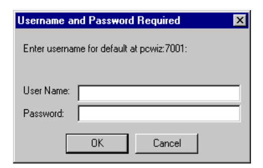
Figure 3-2 Authentication Login Screen

Note: See "Understanding BASIC Authentication with Unsecured Resources" on page 3-14 for important information about how unsecured resources are handled.