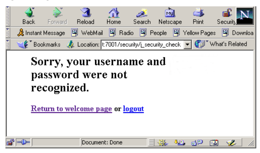
Listing 3-7 Login Error Screen Source Code