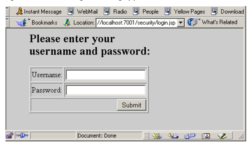
Figure 3-4 Form-Based Login Screen (login.jsp)